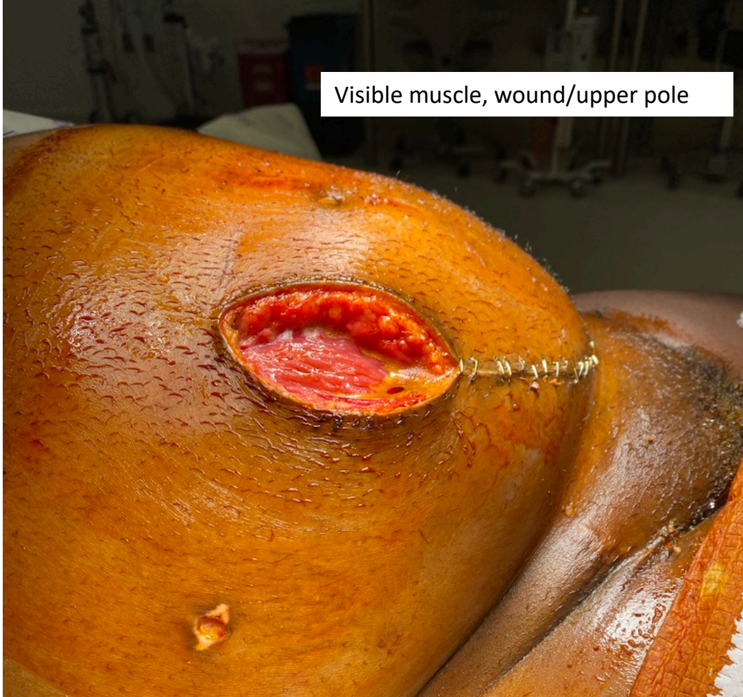
Visible muscle, wound/upper pole

Aug 2020- HTx+ KTx, POD 7 Ogilvie syndrome, POD 3 weeks- seroma,